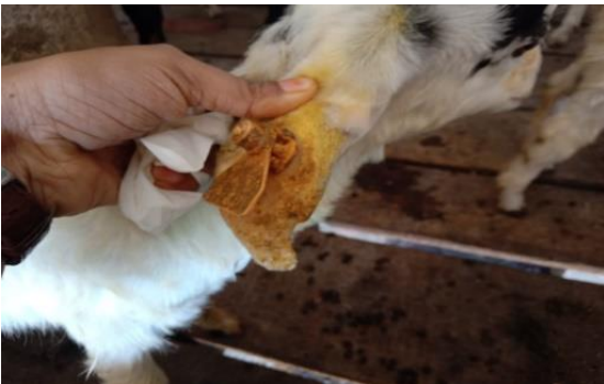
Fig 3: Lesions on 10 th day of application