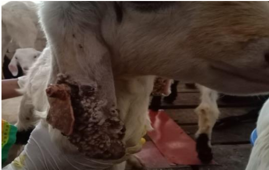
Fig 1: kid exhibiting ORF lesions on ears

(Laffont et al. , 2001; McGaw et al. , 2007) [3, 5]. However, safety and efficacy of this treatment has to be further subjected to detailed study, so that they could form an alternative cost effective strategy for ORF.