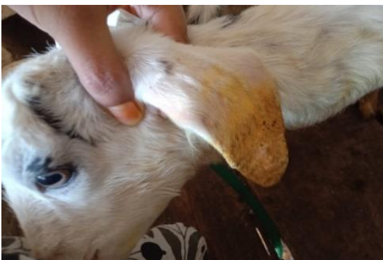
Fig 4: Completely healed at 14 days

ORF in Malabari kids. After further validation of the result, this treatment protocol could be used cost effectively in goats against ORF.