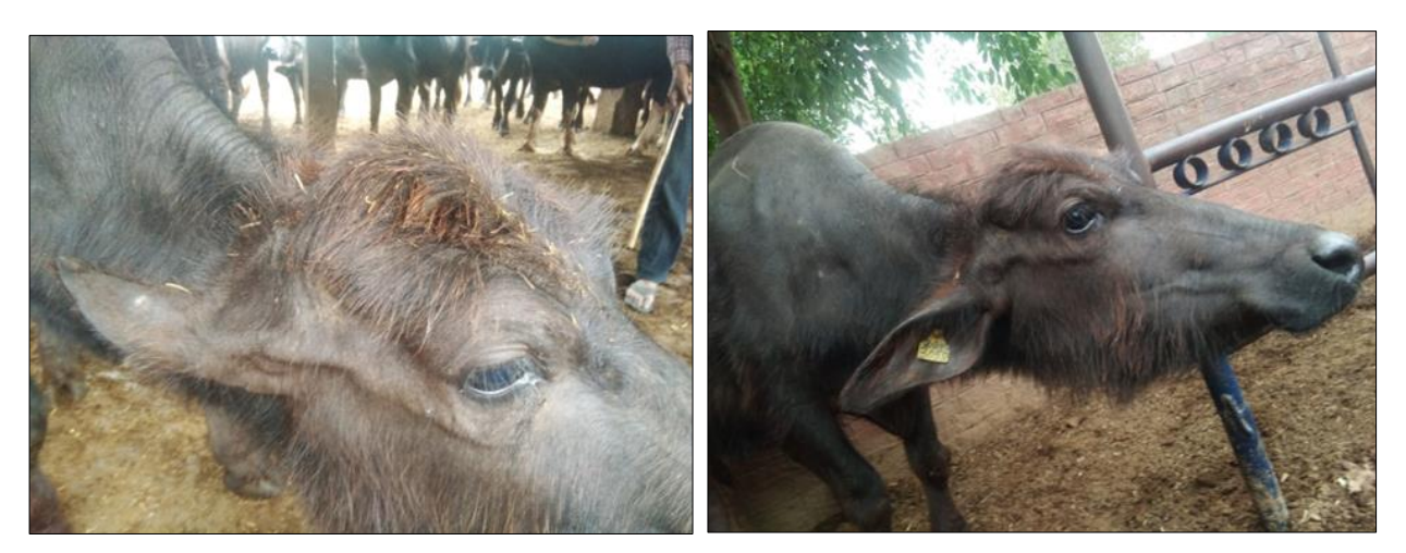
Fig 2: Complete recovery of animal after treatment