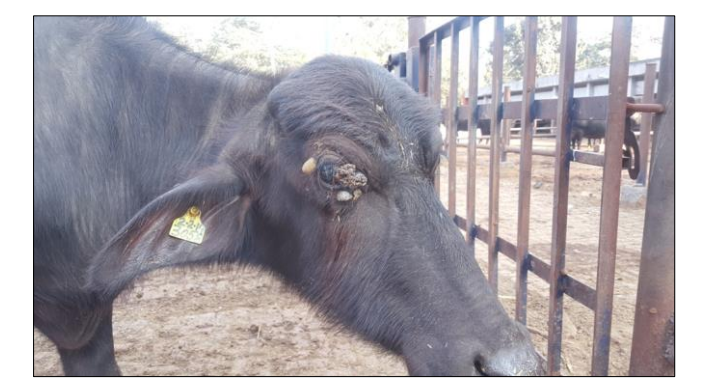
Fig 1: Cauliflower like warts around eyelid.