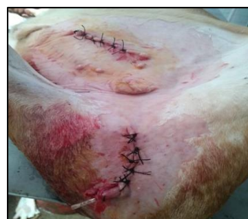
Fig 4: Incision Sites for Cystorrhaphy with urethrostomy