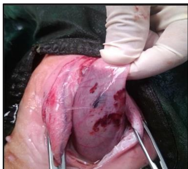
Fig 1: Ruptured Urinary Bladder

Postoperative follow up of tube cystostomy up to three months revealed that nine cases were survived and were voiding normal urine flow from urethral orifice. In two cases, complications were recorded in which flushing with normal saline solution was done after that they recovered successfully.