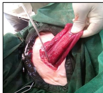
Fig 3: Exteriorisation of UB for cystorrhaphy

This type surgical technique was performed in six cases. Indwelling PVC catheter was removed after sixteen days and skin sutures after ten days of surgery. Success rate of cystorrhaphy with urethrostomy showed five animals recovered uneventfully whereas one animal died on 10 th postoperative days.