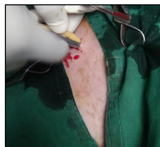
Fig 4: Placement of IP tube

This surgical technique was performed in six animals having ruptured urinary bladder. Out of six cases that were treated by this technique, five survived. Out of these five, four showed uneventful recovery whereas in one animal, surgical intervention was required due to status quo. One case did not respond telephonically that is why no post-operative results were obtained.