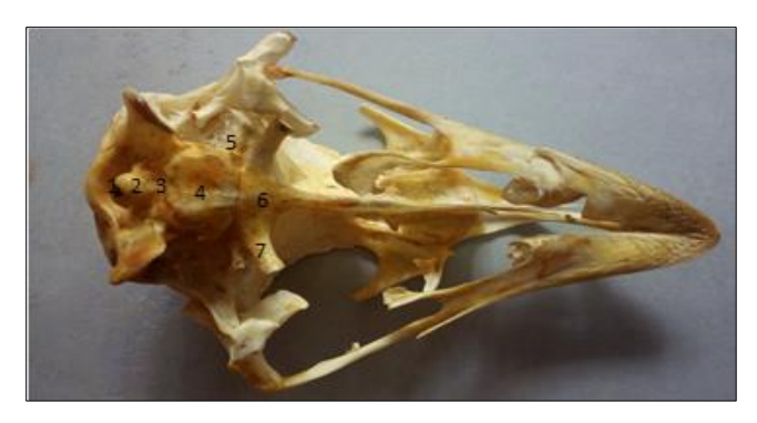
Fig 3: Ventral view of Emu skull 1. Foramen magnum 2. Occipital condyle 3. Basi occipital 4. Basisphenoid 5. Temporal wing of basisphenoid 6. Presphenoid 7. Parasphenoid wings of presphenoid

Basisphenoid had a body and a pair of temporal wings which was observed laterally between it and the parasphenoid wings of presphenoid. Basispenoid was separated from body of presphenoid by a traverse ridge and formed the medial boundary of external acoustic meatus and the foramen for the auditory tube was observed craniomedially. Nickel et al. , 1977<sup>[5]</sup> in duck and goose, observed that the basispenoid had distinct muscular process and grooves.