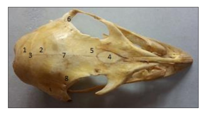
Fig 4: Dorsal view of Emu skull 1. Parietal 2. Frontal 3. Frontoparietal suture 4. Frontal process of frontal 5. Nasal process of frontal 6. Post orbital process of frontal 7. Interfrontal suture 8. Supra orbital fissure

fossa in front and zygomatic process of squamous temporal behind. All these finding are in accordance with Moselhy et al., 2018 <sup>[4]</sup> in ostrich.