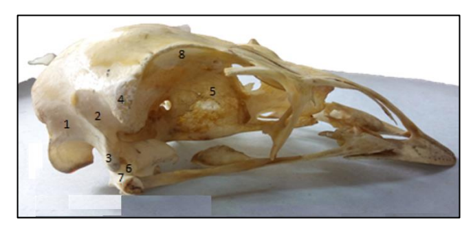
Fig 5: Lateral view of Emu skull 1. Squamous temporal 2. Temporal fossa 3. Zygomatic process of the squamous temporal 4. Orbital process of squamous temporal 5. Interorbital septum 6. Otic process of quadrate 7. Articular part of zygomatic process of squamous temporal 8. Orbital plate of frontal

The temporal bone (Fig 5) formed the lateral wall of the cranial cavity and was situated between parietal and lateral occipital behind, frontal dorsally and sphenoid medially. It