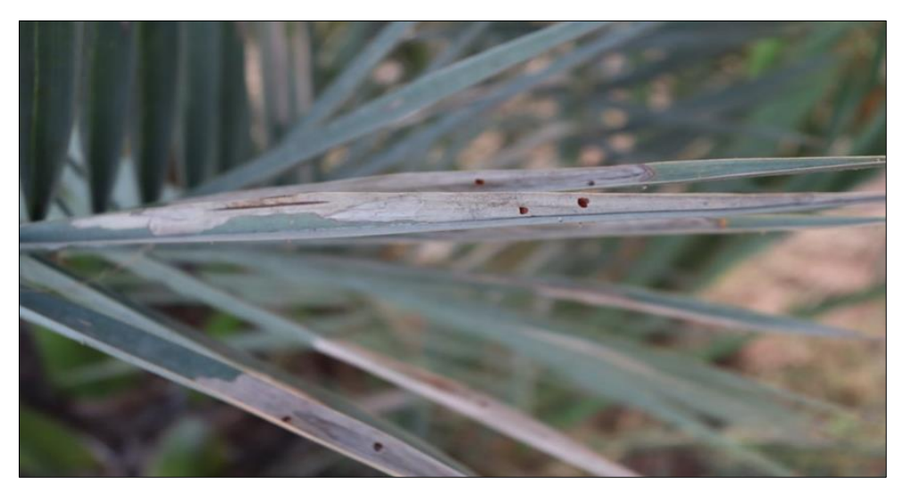
Fig 2: Exit hole on leaflets of date palm

The damaged palm trees were showing characteristic small sized irregular holes approx. 2.0 to 3.5 mm with ragged leaflet symptoms. Damaged dry leaflets with dark coloration on the fronds were distinguishing characteristics of P. dactylifera . The number of adult emergences was determined by the exit hole on each leaflet (Figure 2).