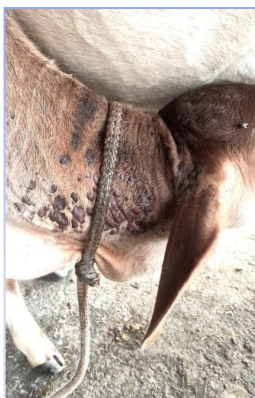
Fig 5: exhibit characteristic lesions such as circular, circumscribed alopecia, and grey-white crust on the neck, ears, and muzzle