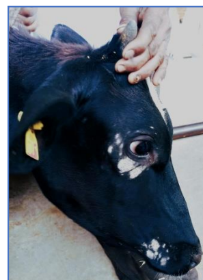
Fig 1: Exhibit characteristic lesions such as circular, circumscribed alopecia, and grey-white crust on the neck, ears, and muzzle

Figure 1, 3, and 5 exhibit characteristic lesions such as circular, circumscribed alopecia, and grey-white crust on the neck, ears, and muzzle. These images were captured prior to treatment. Conversely, Figure 2, 4, and 6 do not display any such lesions as they were taken after treatment. It is evident that the treatment has been effective in eliminating the aforementioned lesions. Iodine is effective against both Gram-positive and Gram-negative bacteria, fungi, and protozoa. It quickly infiltrates microorganisms and oxidizes essential proteins, ultimately destroying the cell. On the other hand, Whitfield's ointment, a century-old remedy for dermatophyte, reduces cohesion between keratinocytes, exfoliating the stratum corneum and removing dead, infected skin. Their approach to treating fungal infections in animals is cost-effective and highly effective, reflecting their commitment to providing the best possible care for affected animals.