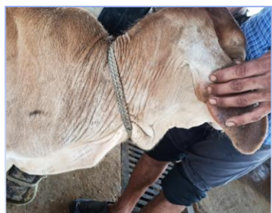
Fig 6: images were captured prior to treatment