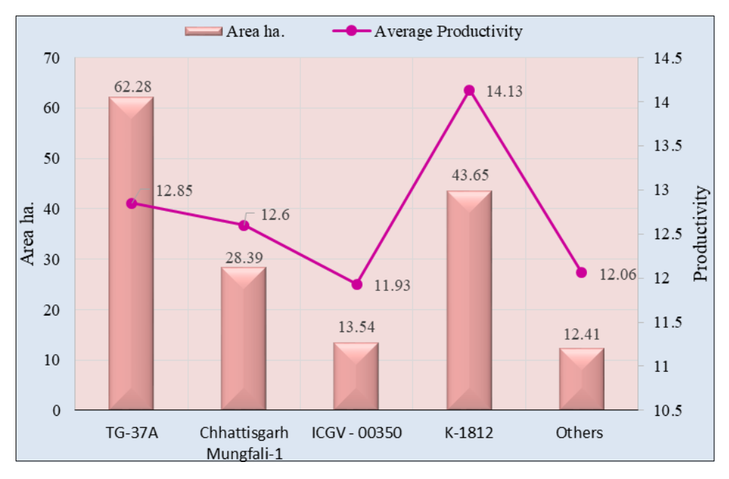
Fig 1: Productivity status of different groundnut varieties cultivated by the respondents