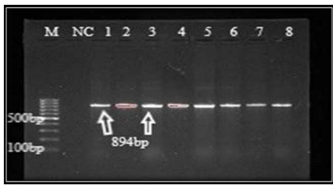
Fig 1: Representative agarose gel showing pcr amplified product of 894 bp for stx 1 of E. coli isolates; Lane M: 100 bp ladder; Lane NC: Negative control ( S. aureus ATCC 25923);Lane 1-8: Samples